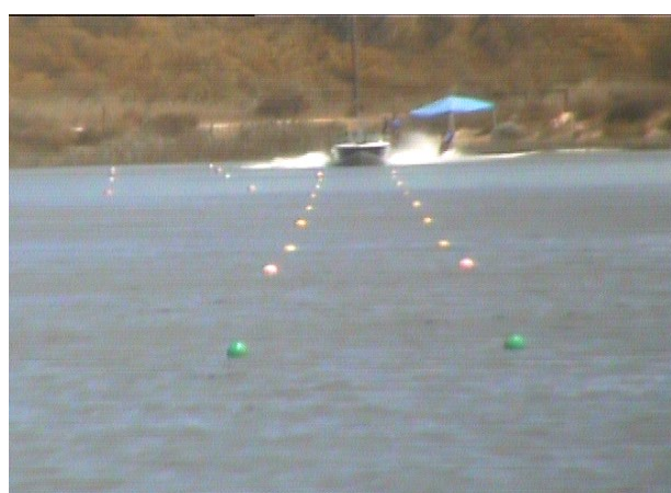
Not enough zoom and image too grainy