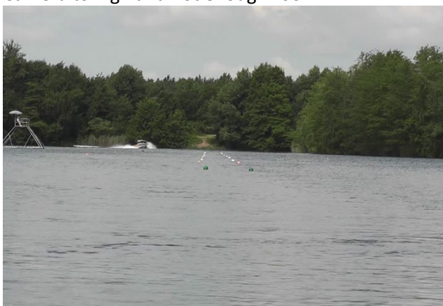
Not enough zoom