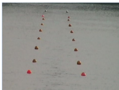
Edges of the monitor not visible camera to high