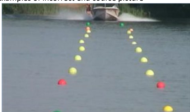
Edges of the monitor not visible