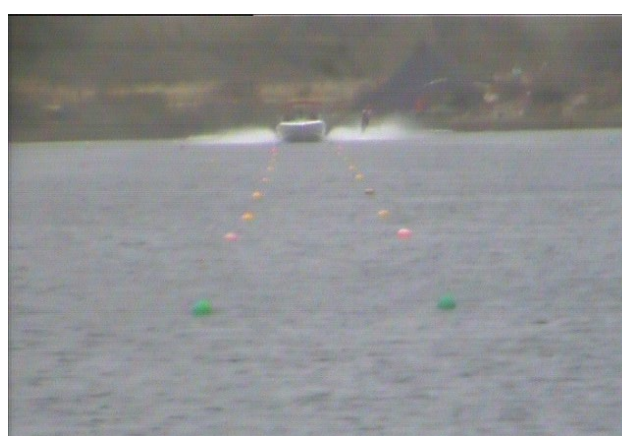
Not enough zoom and image too grainy